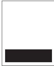
Quarter Page: 4.75 x 1.75